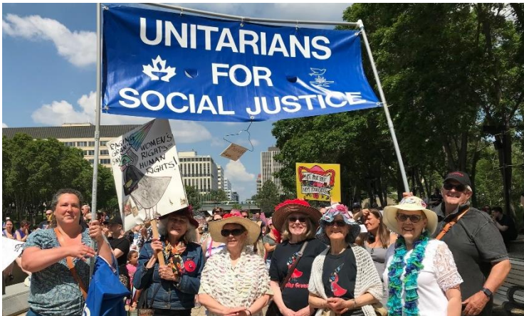
Unitarians supporting women's reproductive rights rally at Alberta Legislature July 3, 2022