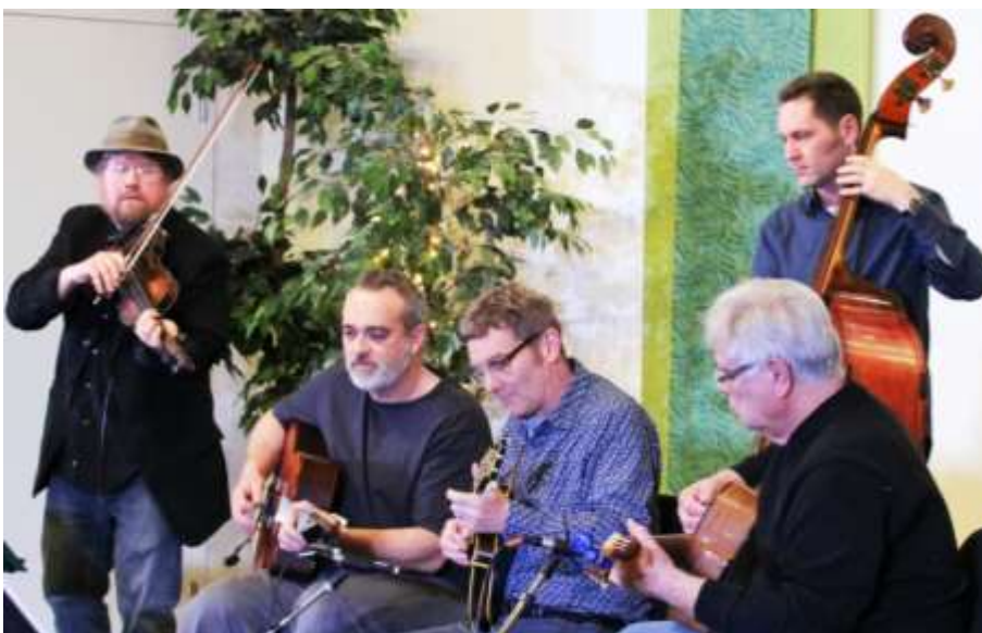
Pont de la Moustache