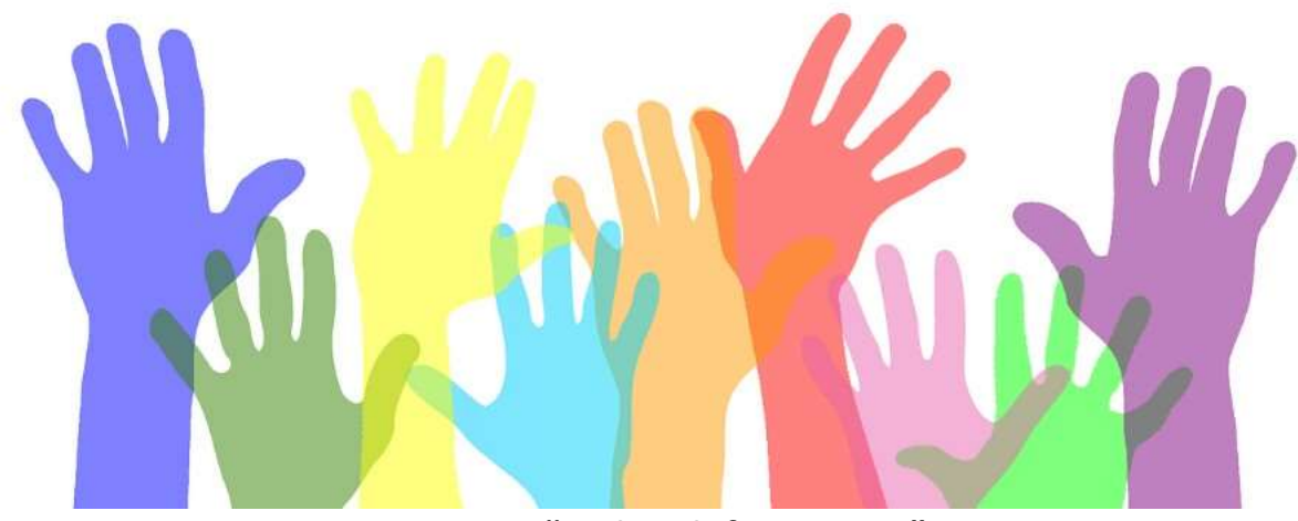
"A Church for Serving"