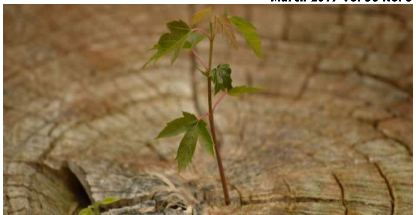
Theme: "A Church for Learning" March Services