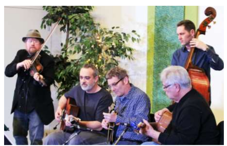
Pont de la Moustache